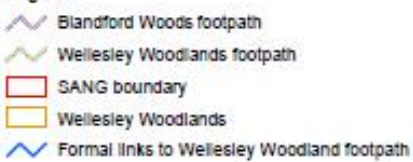
Figure 2. Blandford Woods SANG